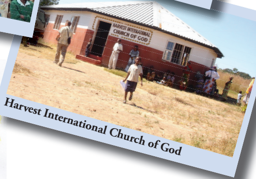
Harvest International Church of God