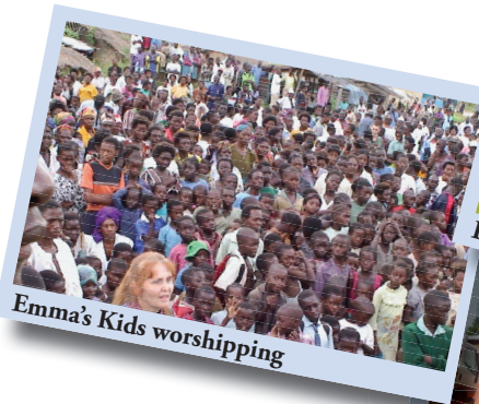
Emma's Kids worshipping

A project called Loaves and Fishes International Agricultural and Missions Training Center was developed where the kids, and others, will be trained in agriculture and the Word of God. A poultry operation named Cecil's Chicks has been completed and has raised 1,000 chicks that supply up to 30 trays of eggs daily.